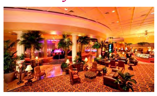
At The Peppermill Resort Casino in Reno, Nevada June 4-7, 2009